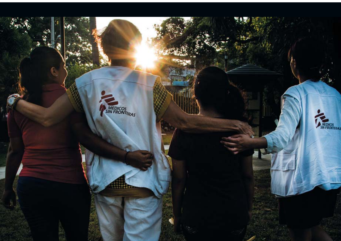
FROM FAR LEFT: A health educator talks about family planning in Mpanamo village in eastern Democratic Republic of Congo.

MSF staff provide medical and psychological care to survivors of sexual violence in Acapulco, Mexico.