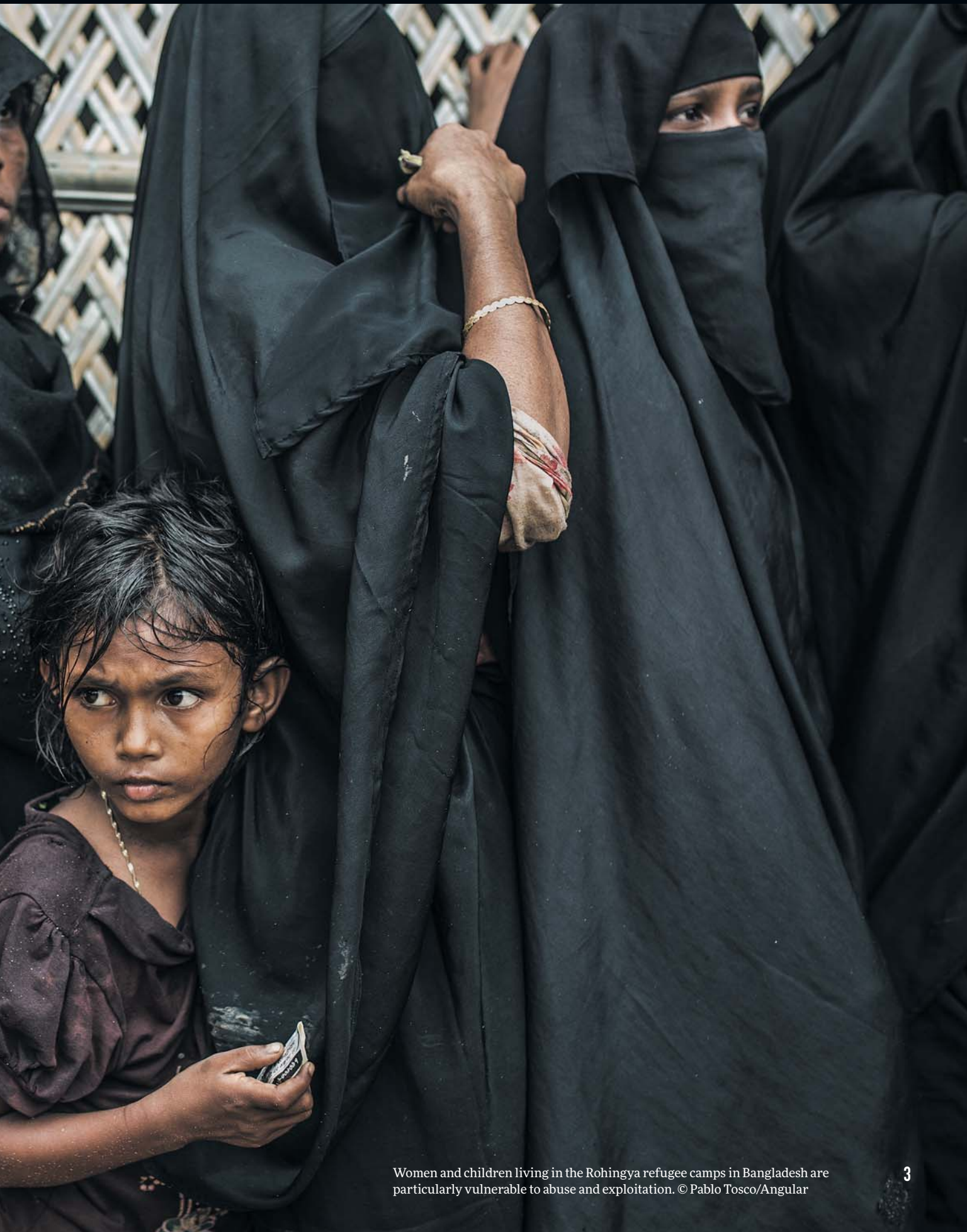
Women and children living in the Rohingya refugee camps in Bangladesh are particularly vulnerable to abuse and exploitation.